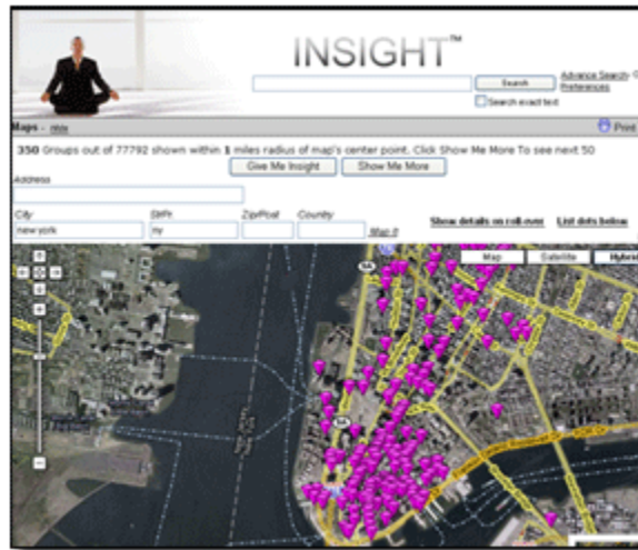
Pinpoint groups based on past booking activity

Salisbury, MD (September 12, 2007) – The Knowland Group™ announced today the launch of INSIGHT™, a revolutionary product that will dramatically alter the way sales managers find group business!